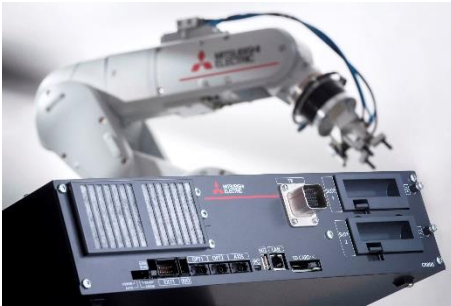
Image 2: Mitsubishi Electric's advanced MELFA robot controllers allow users to programme their robots by using the powerful RT-Toolbox engineering environment.